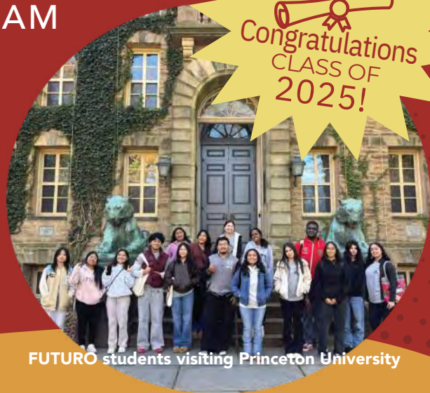
FUTURO students visiting Princeton University

LALDEF's FUTURO initiative is a high-impact youth mentoring program for first- and second-generation immigrant high school students. FUTURO provides students with academic support, SAT preparation, college application assistance, mentoring, social support, and community service opportunities.