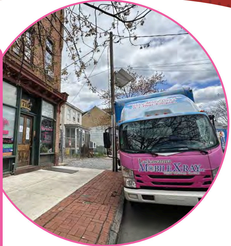
Mammogram Van outside LALDEF's headquarters

At the event, clients also had the opportunity to connect with healthcare providers to schedule other types of cancer screenings.