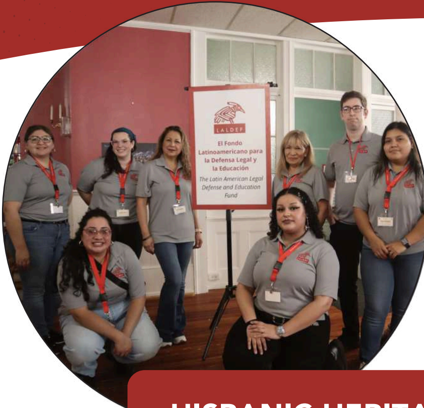
LALDEF Staff at the Hispanic Heritage Month Health Fair on October 4, 2025.